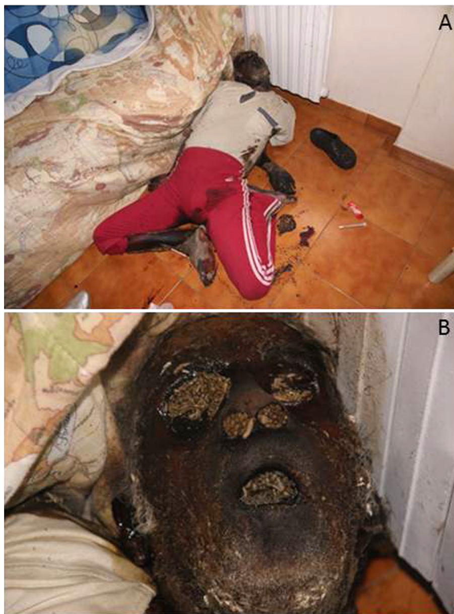
Figure 1: A. View of the room where the corpse was discovered B. Maggots at different life stage inside the natural orifices

investigations of the lungs showed widespread spill, areas with alveolar spaces occupied by eosinophilic edema, red blood cells and polymorph nuclear leucocytes, and areas of emphysema. The heart showed several areas of coagulative necrosis with myofibrillar suffering. The brain showed hydrophic hypoxic degeneration and the liver showed chronic active hepatitis.